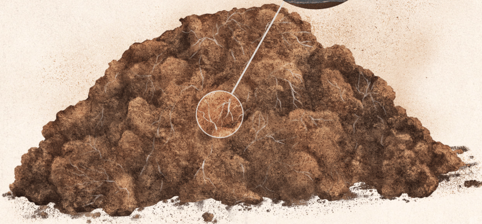
COCCIDIOIDES FUNGUS Valley fever