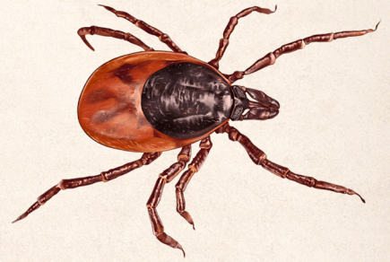
BLACK-LEGGED DEER TICK Powassan virus