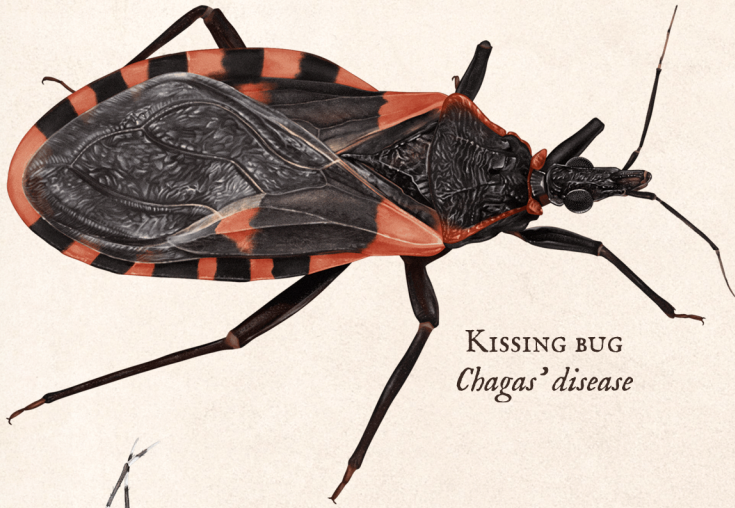
KISSING BUG Chagas' disease