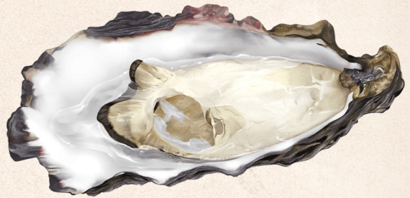
UNCOOKED SHELLFISH Vibriosis